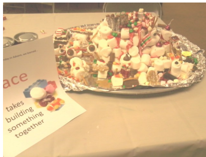
The KIDS learned about Hope, Love, Joy and Peace.

A pile of candy, in the eyes of 4-9 year olds represents a "Peace Tower" - we learned that peace takes building something together.