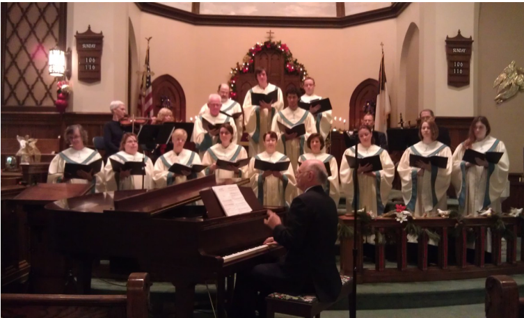
The senior choir presents their annual cantata.