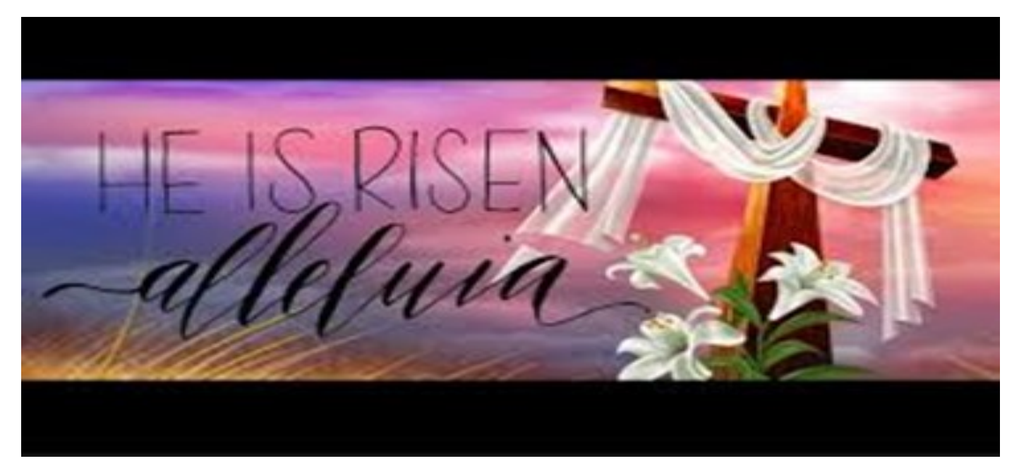
May 5,2024 Sixth Sunday of Easter